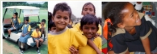
Christel House is a registered 501(c)(3) public charity. Donations are deductible to the extent allowed by law.

For more information about Christel House, please visit: www.christelhouse.org .